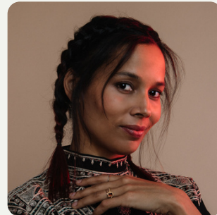
Rhiannon Giddens Board Member